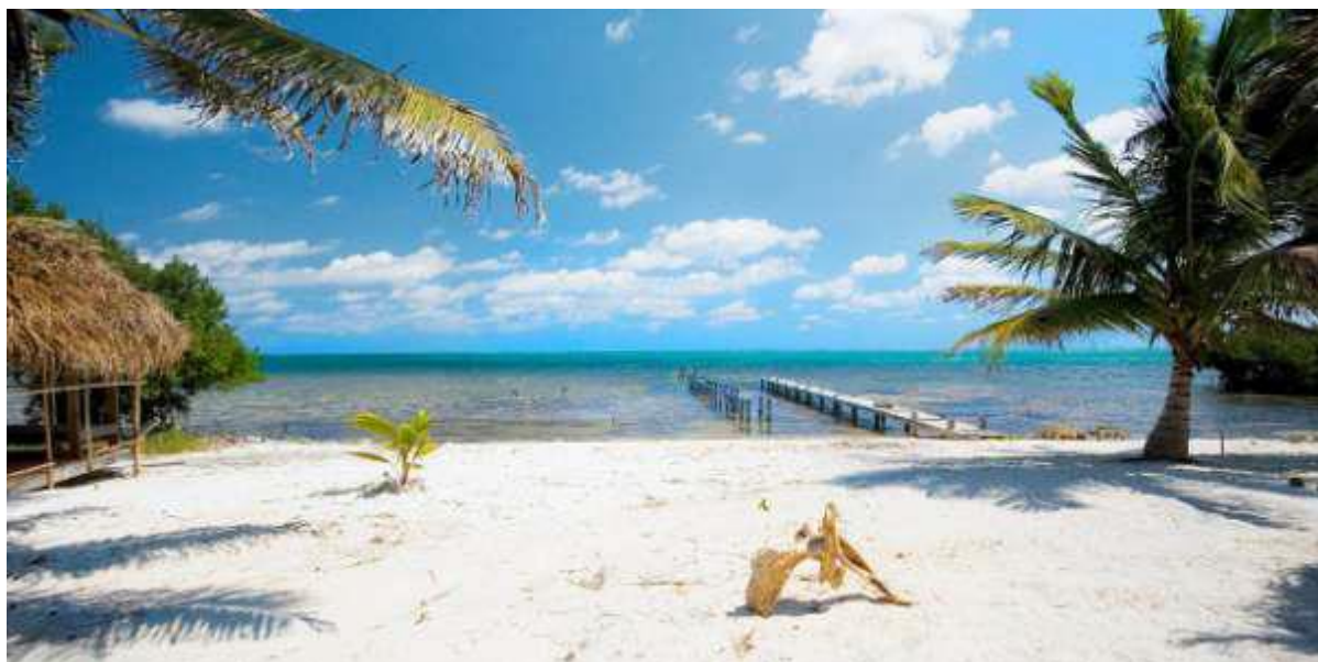
View from the cabanas at Bacalar Chico Dive Camp the base for the expedition

They have a team of dedicated researchers and volunteers who study all aspects of the marine ecosystem - from fish species and coral all the way through to local fishing techniques and ways of life.